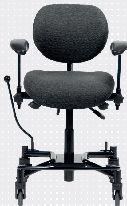
VELA Tango 50

VELA Tango 50 is a basic and low-cost work chair. It is developed to enable the user to keep the usual level of activity and independence at home and at the work place – despite disability. A unique central brake ensures that the user has a stable work place. This means, that working in the kitchen with knives or boiling water is safe. Four smoothly running and direction-stable wheels make the chair easy to 'walk'.